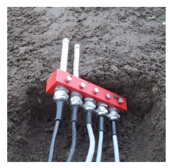
Figure 2: High resolution temperature profile of ground temperature in 1 cm steps. The upper probe is +1 cm above ground and the next one directly on the surface at 0 cm.

All states of the ground with and without snow coverage (WMO codes 0901 and 0975) are defined by the visual appearance of the earth's surface, complemented by descriptions that are using the human sense of touch. To cover this visual appearance, a web camera was used to automatically take pictures in suitable time intervals (e.g. 10 minutes). We were using an industrial video camera (SONY FCB-EX470) in combination with an AXIS video server to attain an acceptable picture quality. Before transmitting the pictures to a remote web server a timestamp was added on the pictures. Useful meteorological parameters such as air temperatures, ground temperatures and present weather were also stamped into the corresponding picture by automatic post processing on the remote server. We were using the Linux software "convert" for this process. Any results that are derived from these pictures are verifiable as the stored pictures are documenting the visual situation.