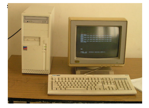
Fig. 3 Data Receiving PC

In mid 1995 all these tele-printers were replaced by PCs and conventional dot matrix printers. Interface unit and software development were locally done by DoM. Two separate PCs were used for data transmitting and receiving. Data exchange was extremely slow due to the narrow bandwidth of 50 bauds. Nevertheless this system was far better than the tele-printer based