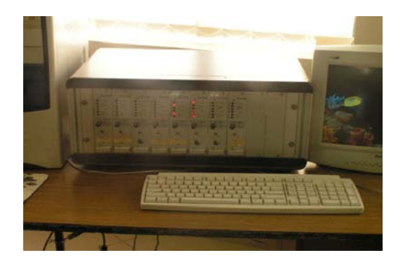
Fig. 2 Interface Unit

In mid 1995 all these tele-printers were replaced by PCs and conventional dot matrix printers. Interface unit and software development were locally done by DoM. Two separate PCs were used for data transmitting and receiving. Data exchange was extremely slow due to the narrow bandwidth of 50 bauds. Nevertheless this system was far better than the tele-printer based