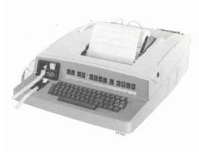
Fig. 1 Sagem TX-20 Teleprinter