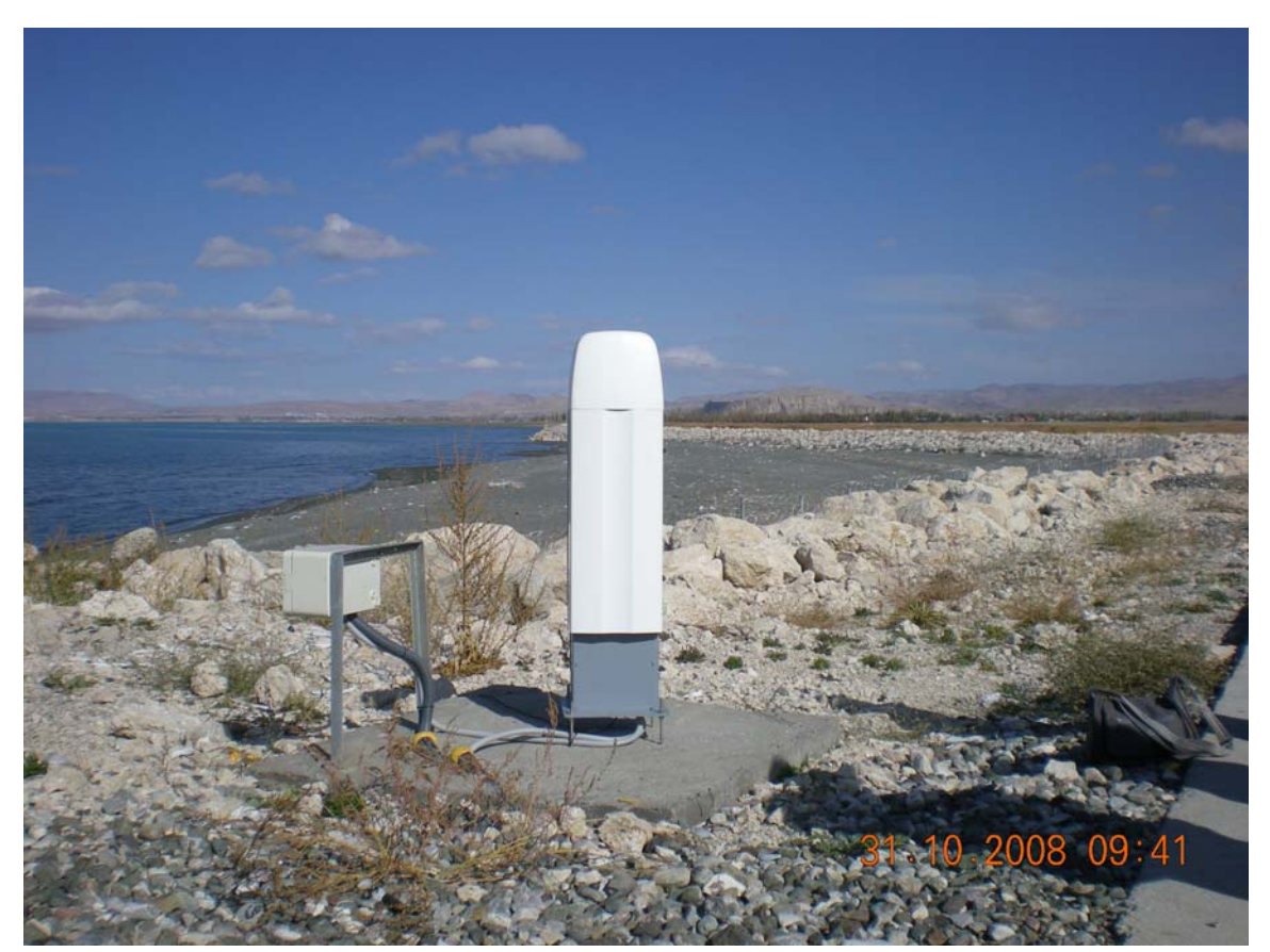
Figure 7: AWOS in the coast