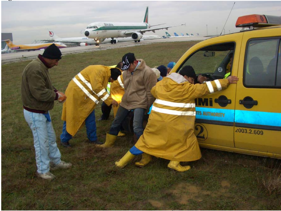
Figure 8: AWOS maintenance in Atatürk Airport, İSTANBUL