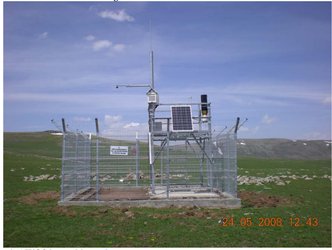
Figure 4: AWOS located in a plateau