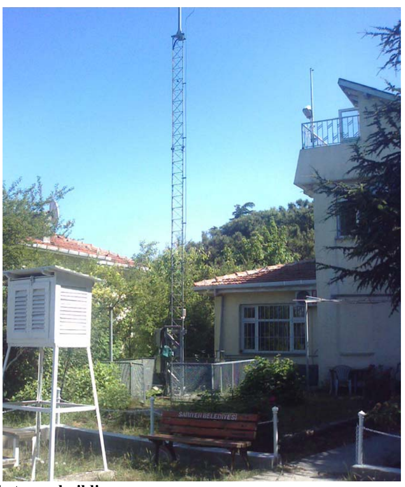
Figure 3: AWOS between buildings