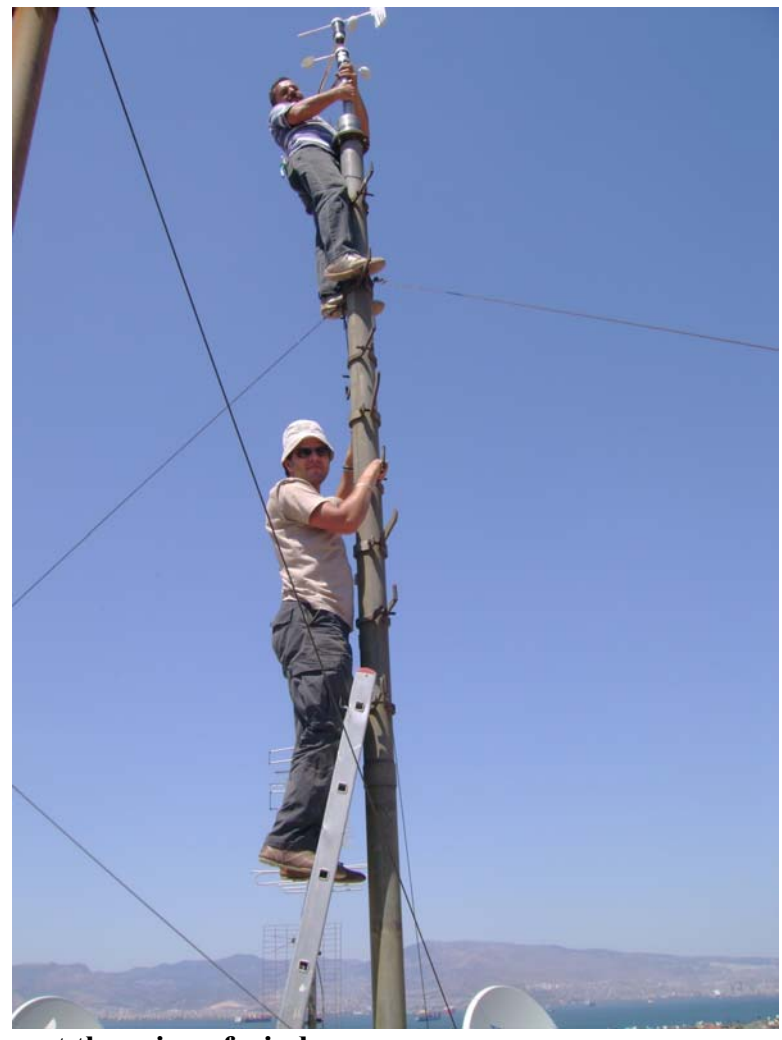
Figure 9: Replacement the oring of wind sensor