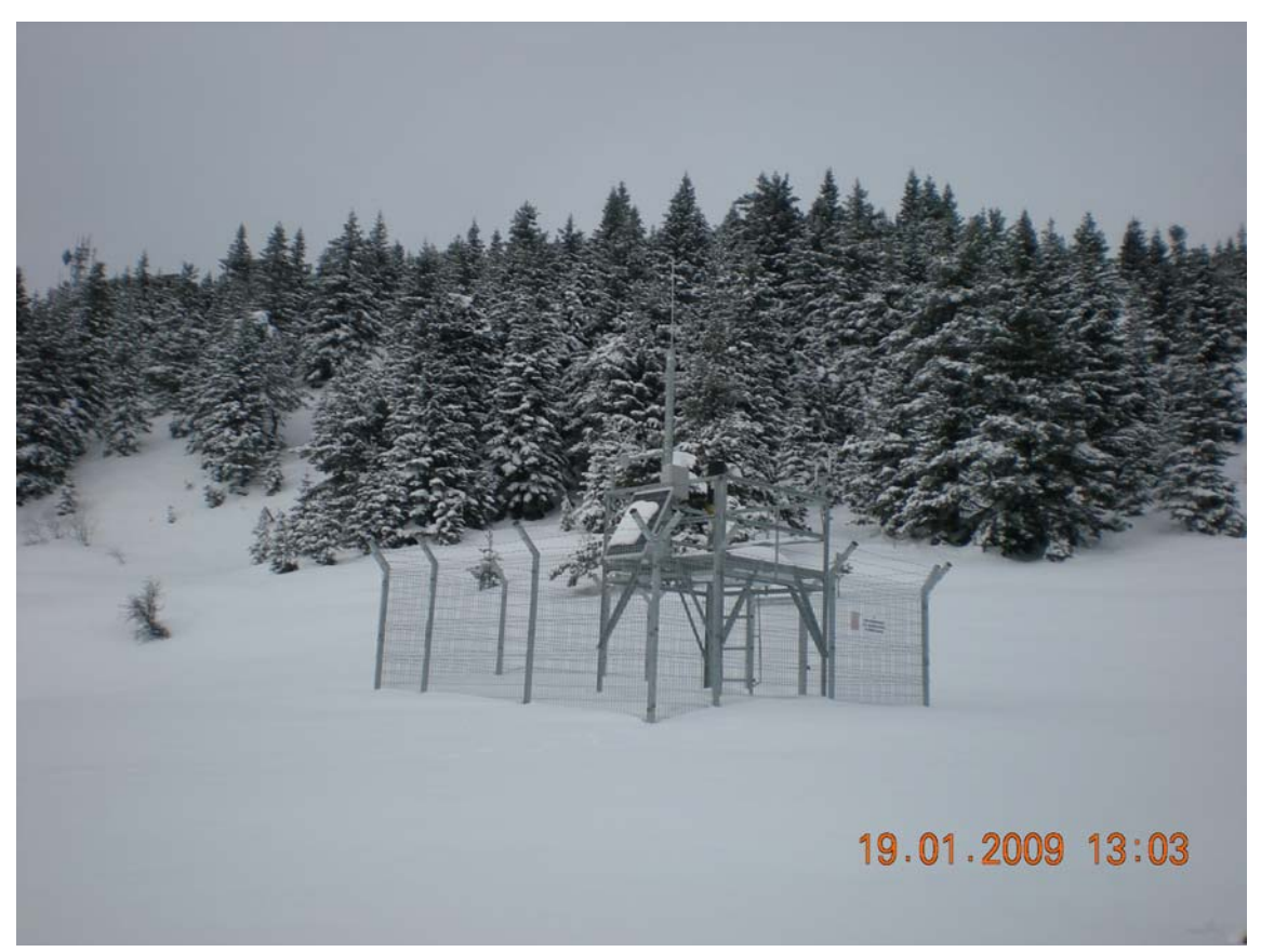
Figure 5: AWOS in a forest