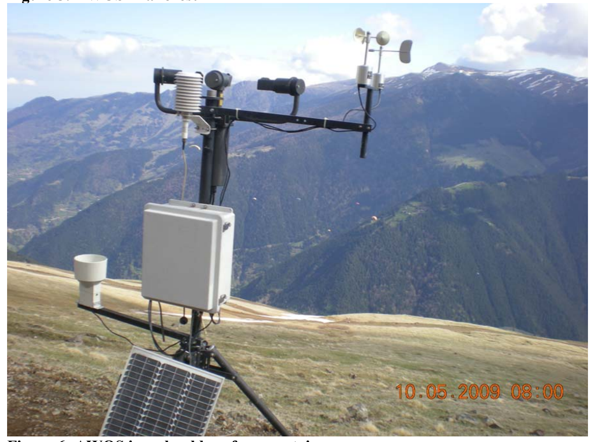
Figure 6: AWOS in a shoulder of a mountain