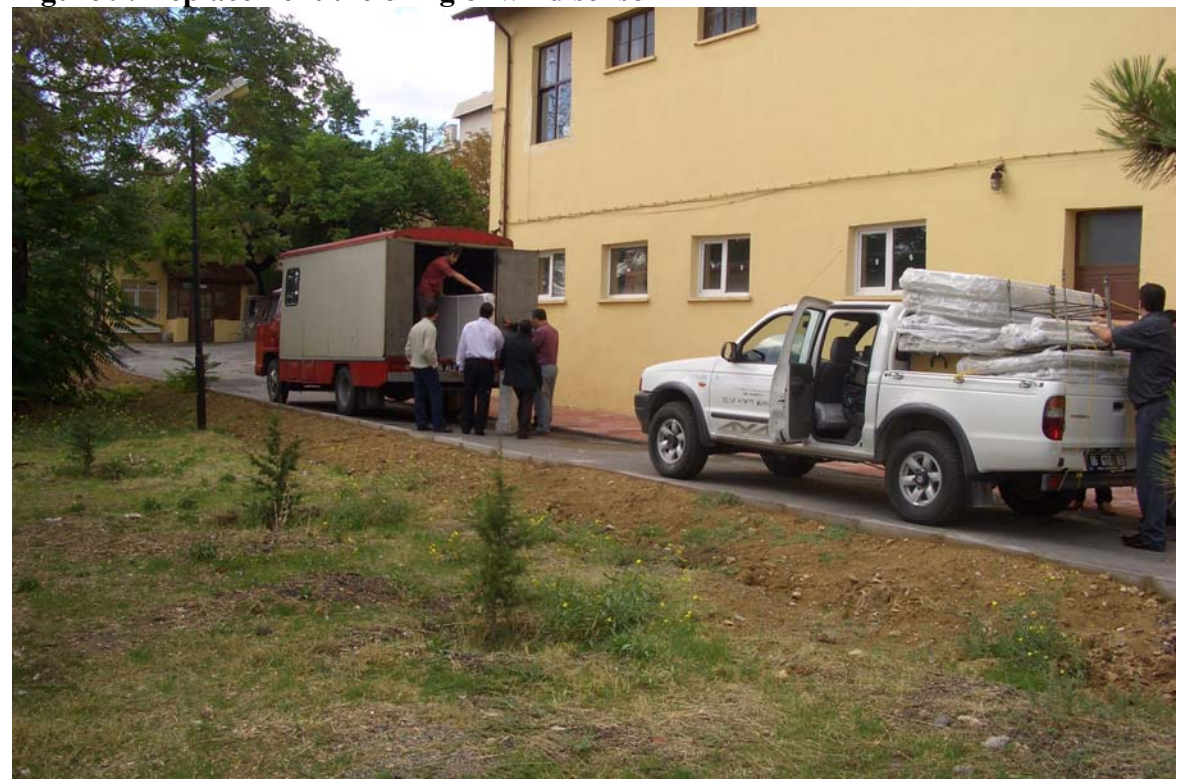
Figure 10: Preparing to journey in order to install an AWOS in a station area

Figure 9: Replacement the oring of wind sensor