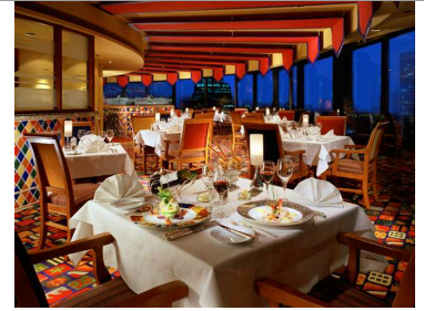
Tour de Ville Restaurant