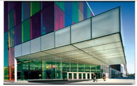
Palais des congrès