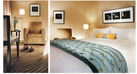
Delta guest rooms