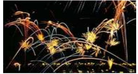
Montréal International Fireworks Competition