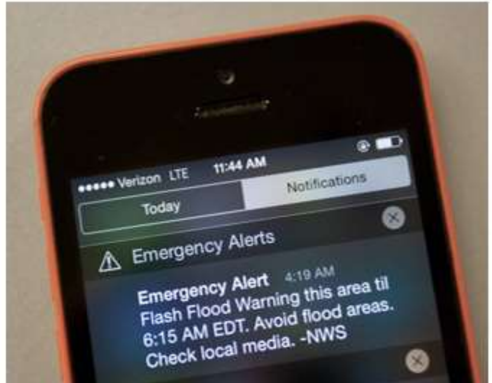
Wireless flash flood alerts