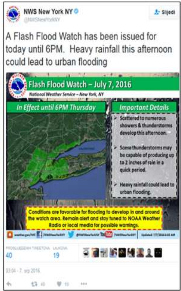
Examples of flash flood warnings and flash flood watch notifications on Facebook and Twitter