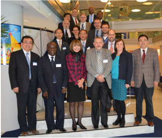
Participants at the “Meeting of the Executive Council Working Group on Service Delivery (ECWG-SD)”, WMO Headquarters, Geneva, Switzerland, 25-27 March 2014

http://www.wmo.int/pages/prog/amp/pwsp/documents/ECWG-SD-2014_FinalReport_1_.pdf .