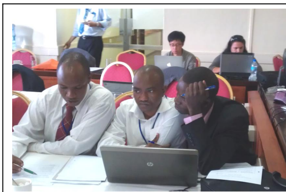
Participants at the “SWFDP-Eastern Africa Regional Training Workshop” (Arusha United Republic of Tanzania, 28 November - 2 December 2011)

I am also pleased to inform you that, under the Severe Weather Forecasting Demonstration Project – Eastern Africa (SWFDP-EA), training was organized for PWS Focal Points from Burundi, Ethiopia, Kenya, Rwanda, Uganda and the United Republic of Tanzania. The training was focused on equipping participants with skills for effective delivery of services associated with severe weather, in support of saving life and property. Specific tasks for the Focal Points were agreed upon for them to perform in their respective NMHSs after the workshop.