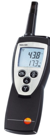
Temperature & Humidity