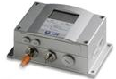
Air Pressure & Tendency