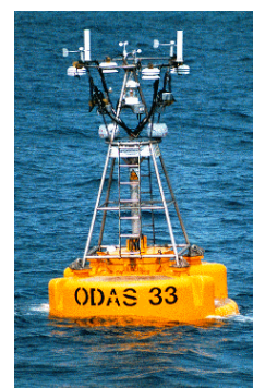
E-SURFMAR moored buoy (North Atlantic)

http://www.jamstec.go.jp/jamstec/TRITON/