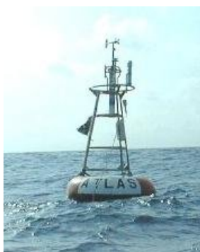
TAO/PIRATA array moored buoy (equatorial Atlantic & Pacific)

http://www.pmel.noaa.gov/toga-tao/ http://satelite.cptec.inpe.br/imagens/dadospcd/pirata/ http://www.brest.ird.fr/pirata/piratafr.html