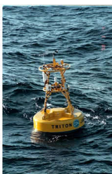
TRITON moored buoy (Western equatorial Pacific)

http://www.pmel.noaa.gov/toga-tao/ http://satelite.cptec.inpe.br/imagens/dadospcd/pirata/ http://www.brest.ird.fr/pirata/piratafr.html