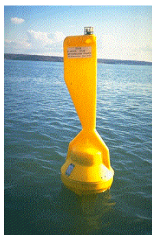
Wind measuring meteorological drifting buoy