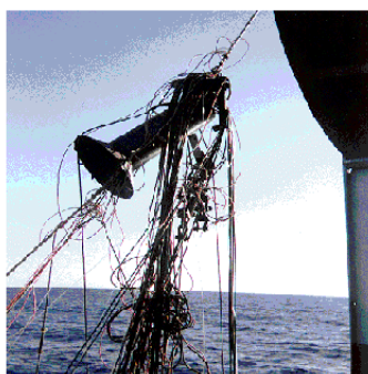
Longline fishing gear entangled in a TAO mooring.