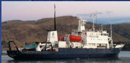
US Dept of State (SOMMER)