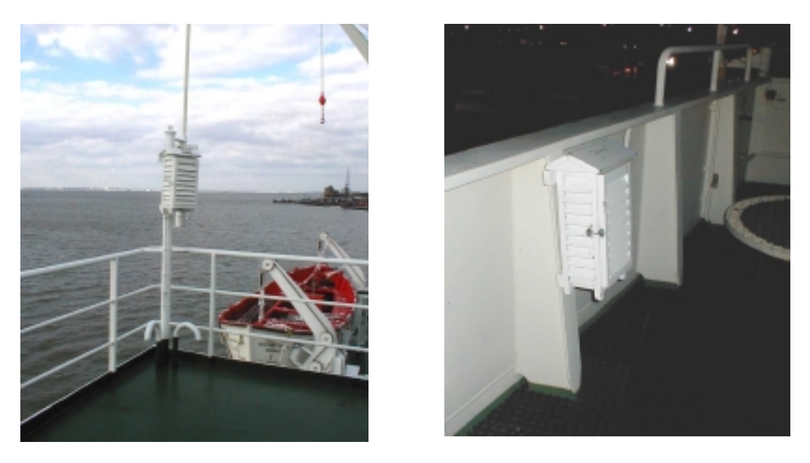
Figure 1. Examples of varying quality of screen exposure on UK recruited VOS.