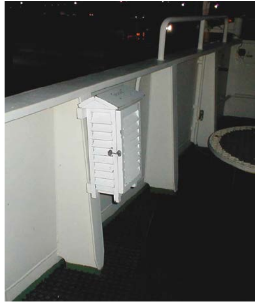
Figure 1. Examples of varying quality of screen exposure on UK recruited VOS.