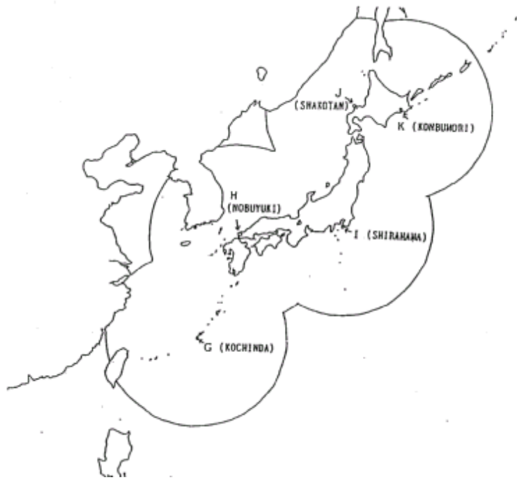
Fig.2 Area of responsibility for the NAVTEX of Japan and locations of the NAVTEX operation centers