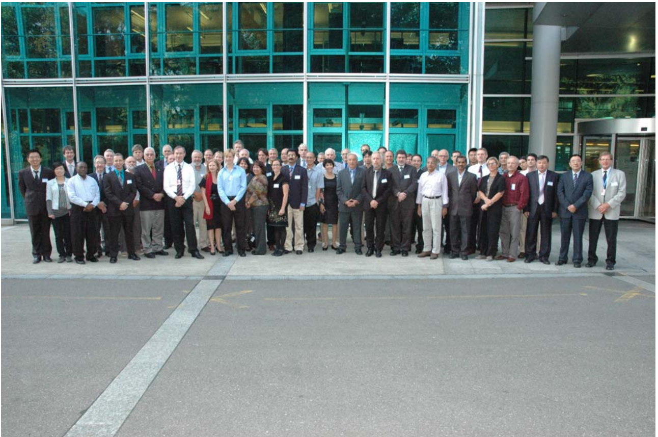
(DBCP-27 group photo, Geneva, 29 Sept. 2011)