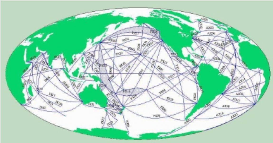
Figure 3: XBT line numbering scheme.