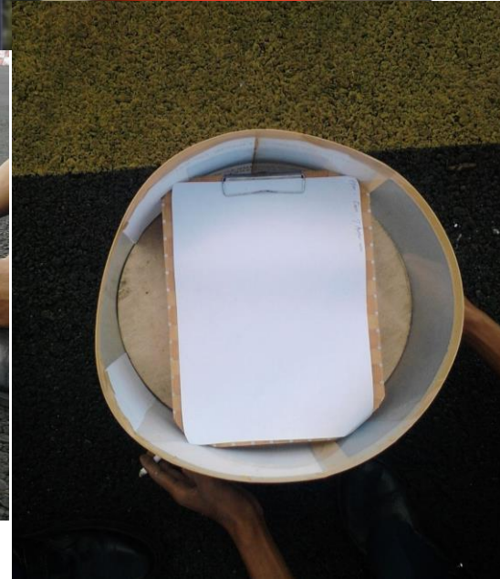
Simple Paper Test Report