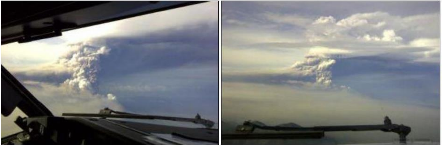
Photos of the eruption column by Peter Bosch, taken from the cockpit of his 737. Published by The Jakarta Globe 1 .